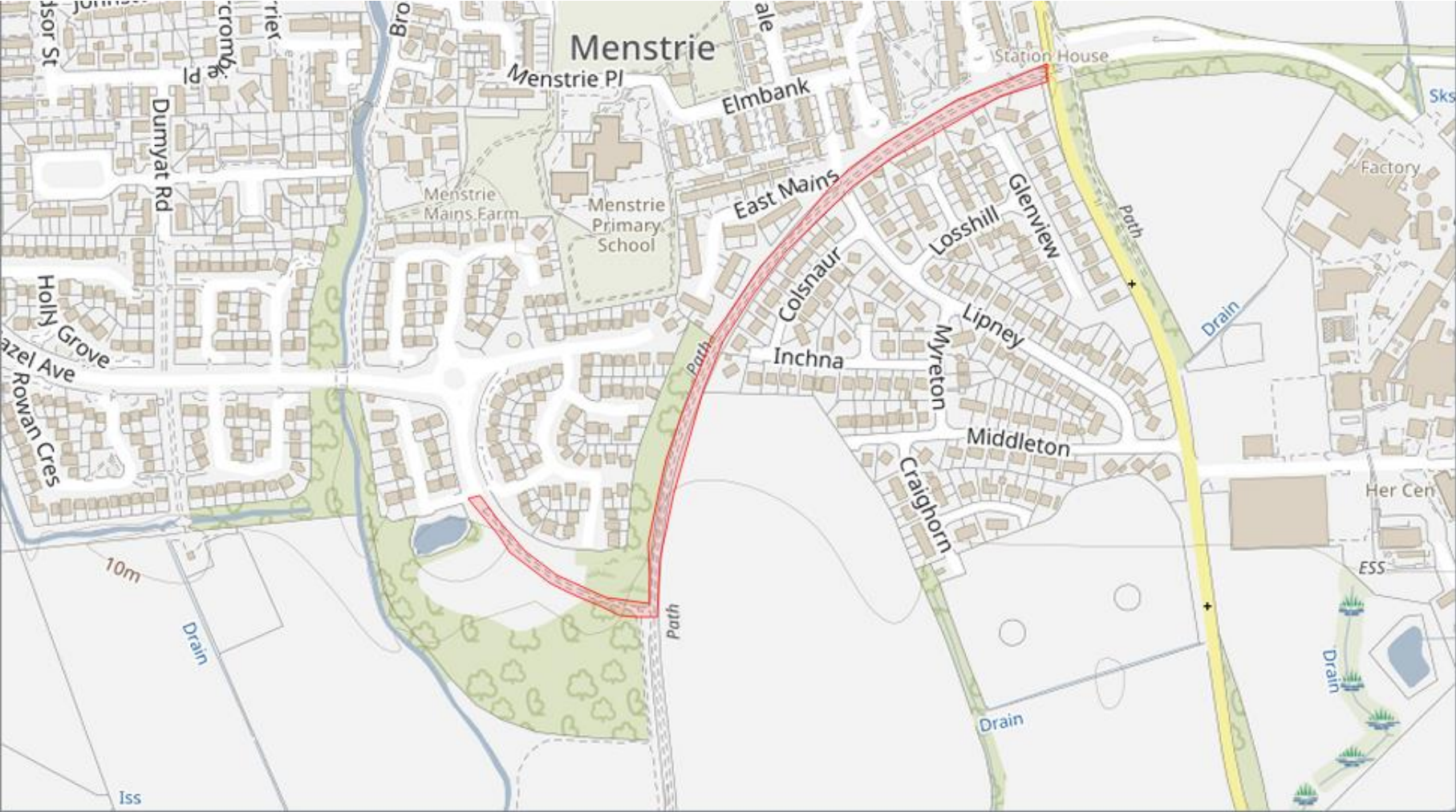
Appendix 2: Map highlighting the intended street lighting in red on SUSTRANS route NCN768