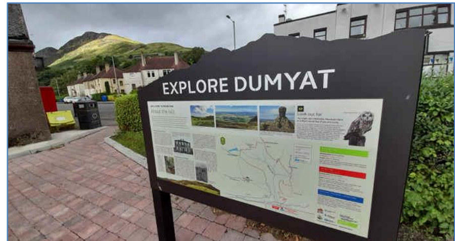
One of the new interpretation boards installed in Menstrie

The completed works have been well received by local groups and residents and have enhanced and complemented other initiatives by the Community Council and Community Action Group to improve the amenities for local residents and attract visitors to the village. This includes taking over management of the Dumyat Centre to sustain community facilities including the provision of public toilets, the installation of an outdoor gym and covered cycle parking next to the carpark and managing a community garden accessible from the carpark. This has helped deliver the Dumyat Visitor Hub.