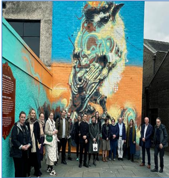
Visit to Alloa by delegates from City of Stavanger