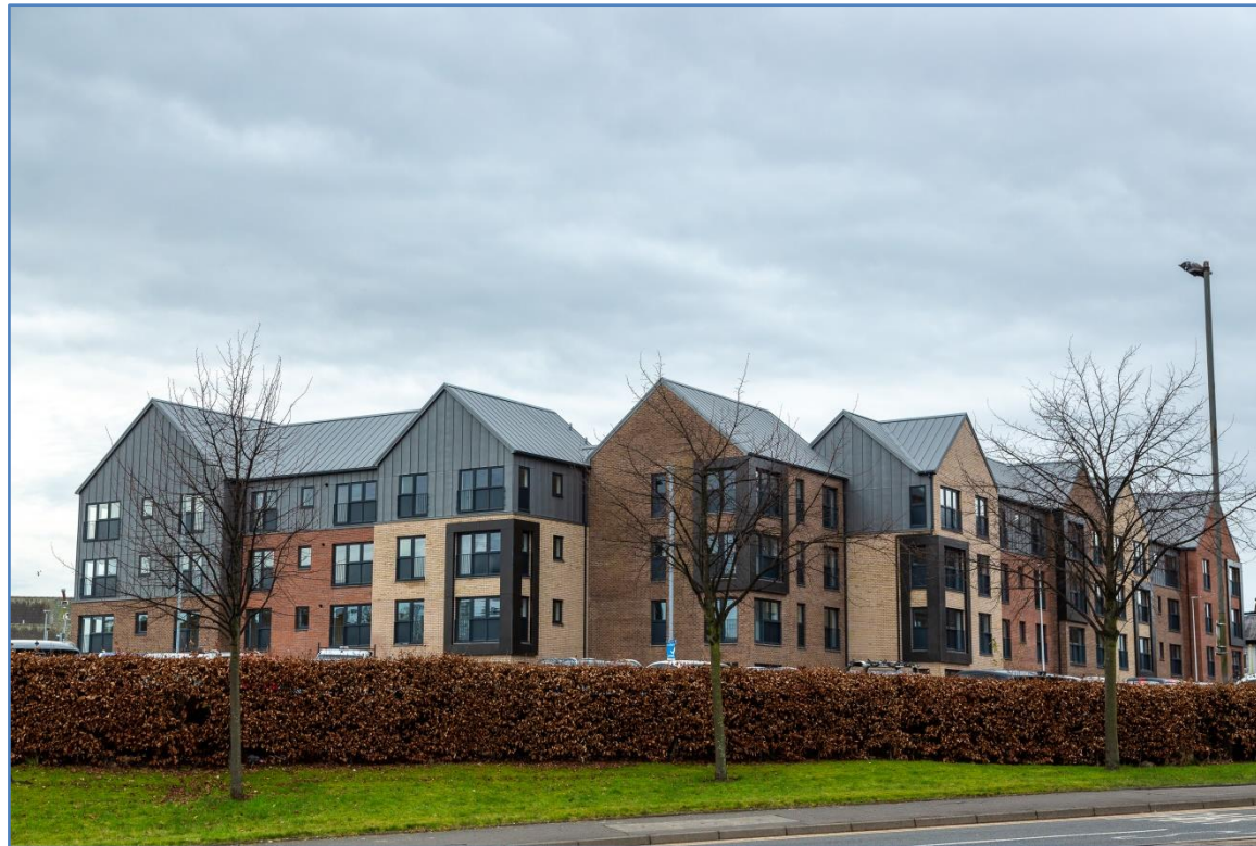
Primrose Street flats

recreate a perimeter block pattern, better address street frontages and respond appropriately to the site's conservation area setting. As a result of the planners facilitating the front-loading of this expertise into the pre-application design stages, the subsequent planning application was approved well within the statutory time period.