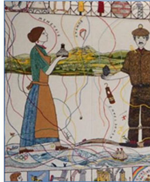
Part of the Clackmannanshire Tapestry housed at Alloa Hub

The Council's Planning Service is now building on the momentum of these successes through development of a town centre masterplan in collaboration with the Council's partners and stakeholders.