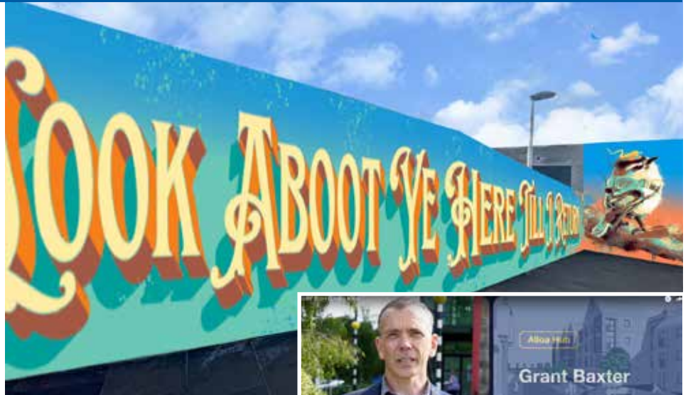
The vibrant Look about ye til mural includes the county's motto and links this to a painting of a Goldcrest; the smallest bird in Scotland, drawing parallels with Clackmannanshire's status as the 'Wee County'. The Goldcrest's Latin name is Regulus Regulus, meaning King, and linking it back to the County's motto which is attributed to King Robert the Bruce.

Clackmannanshire Council, in partnership with Alloa First Business Improvement District (BID) and Clackmannanshire Third Sector Interface, submitted an application under the banner of 'Living Alloa' and are delighted to have made the shortlist in the Improving Scotland's Places category.