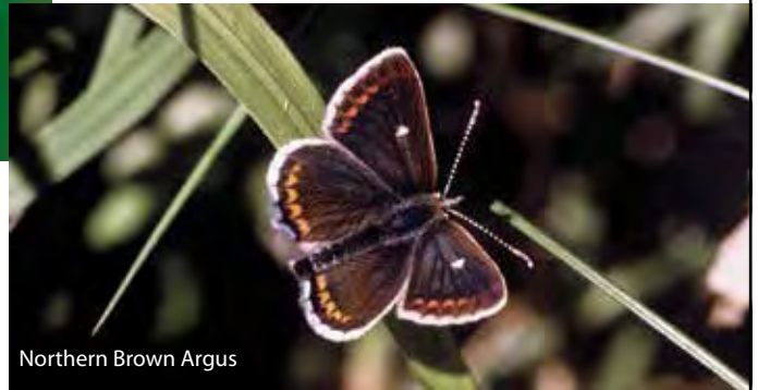
Northern Brown Argus

A brilliant display of bluebells Hyacinthoides non-scripta can be seen in the spring in the Woodland Park. The non-native Spanish bluebell has paler blue flowers and stiffer stems and is hybridising with the native bluebell. Be sure to plant the native species in your garden.