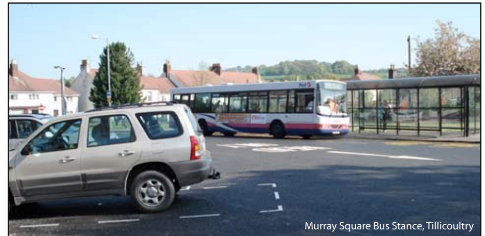
Murray Square Bus Stance, Tillicoultry

You can even try Park and Stride on the journey to school. Children can walk some of the way to school with parents or friends. Walking gives children a chance to get a little exercise, teaches the child vital pedestrian skills and takes away traffic congestion from the front of the school making it safer for everyone else on foot.