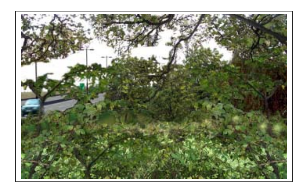
B View at year 15