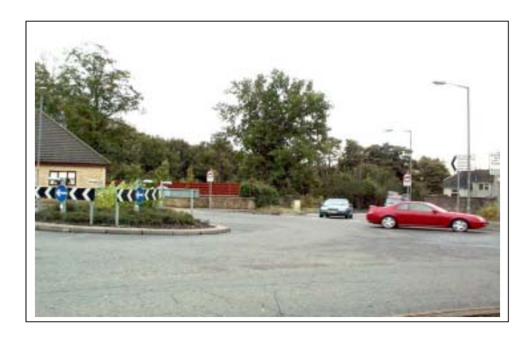
A Current View