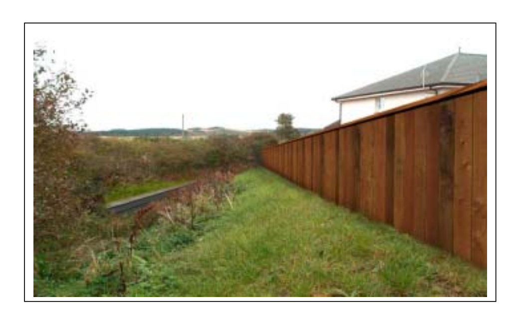
B View at year 15 (Photomontage 5 of 10)