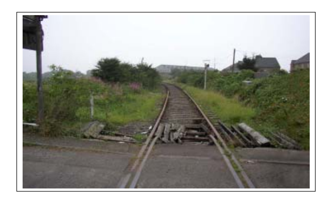
A Current View