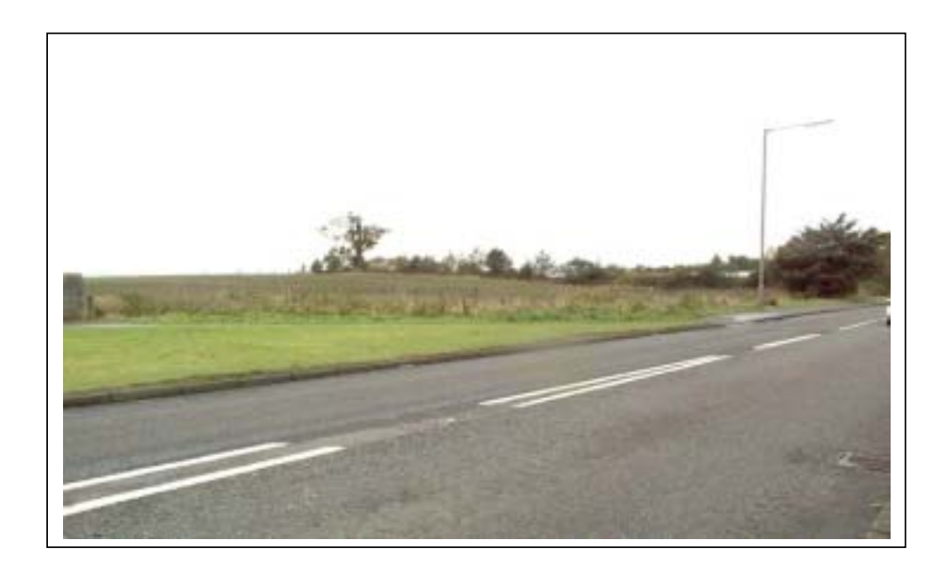
A Current View