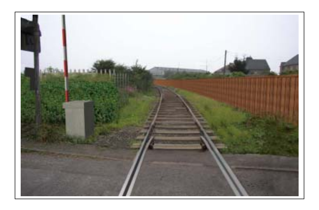
B View at year 15 (Photomontage 10 of 10)