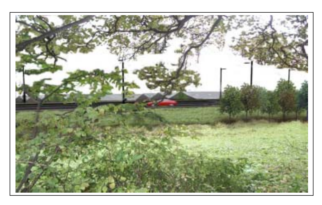
B View at year 15 ( This does not include future development of housing sites and landscape proposals designated in the Local Plan) {\bf P}