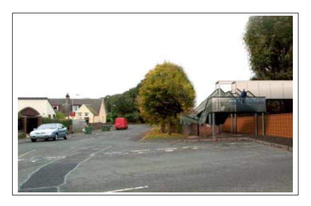
B View at year 15 (Photomontage 2 of 10)