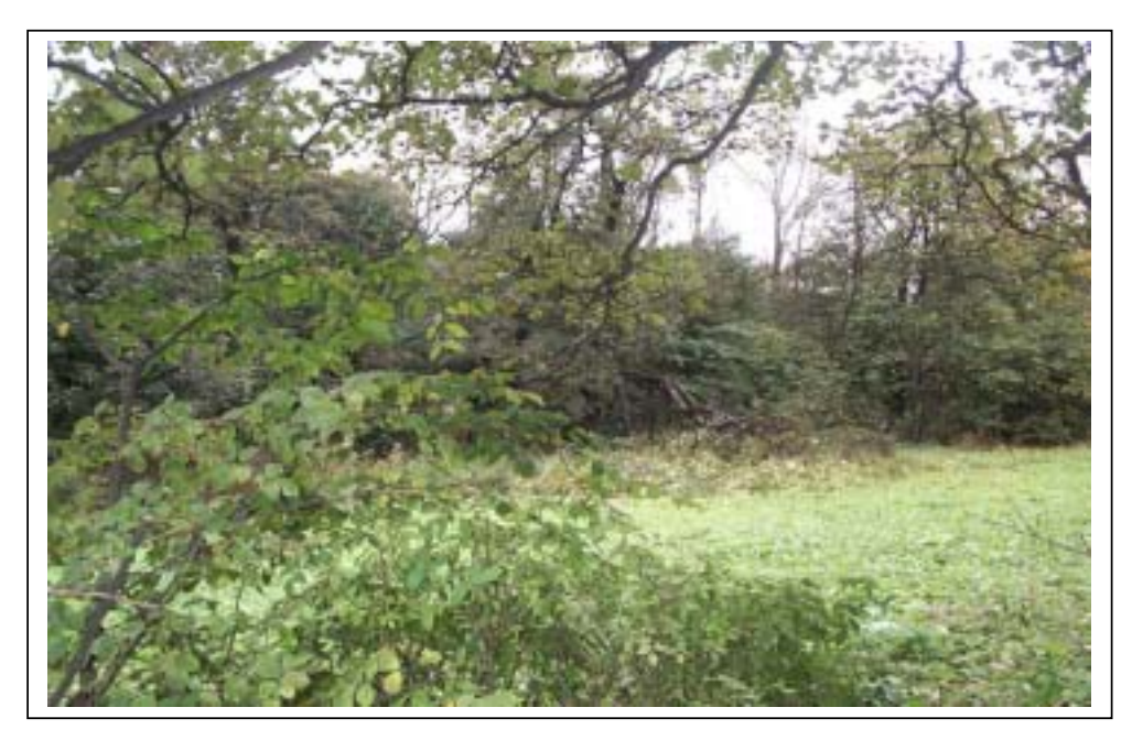
A Current View