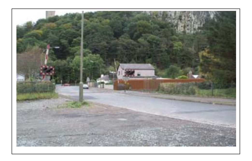
B View at year 15 (This does not include the proposed housing site outwith the level crossing area) \frac{1}{2}