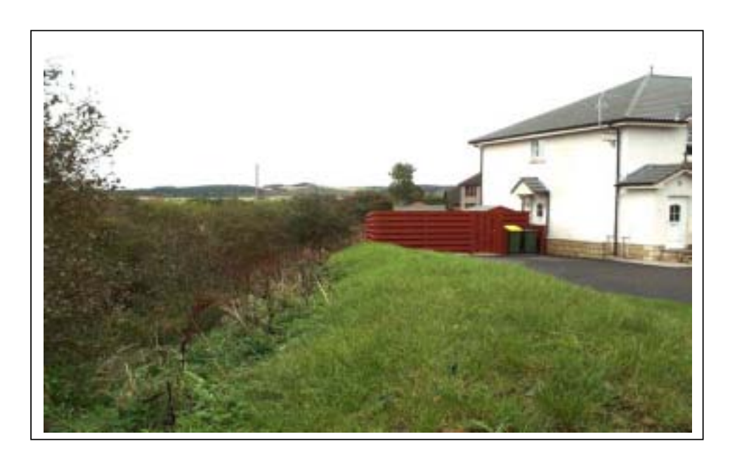
A Current View